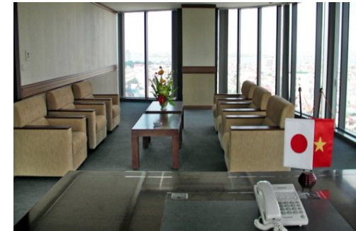
【Hochiminh Brnanch Office】